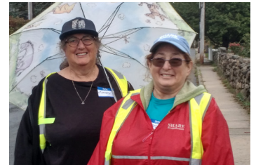
Smiling walkers from Fun Walk 2023 gathered in support of SHARE despite the rainy weather.

its incorporation in 1982, the SHARE Foundation has assisted approximately 4,000 people with disabilities, such as ALS (Lou Gehrig's disease), spinal cord injury, cerebral palsy, multiple sclerosis, stroke and other conditions.